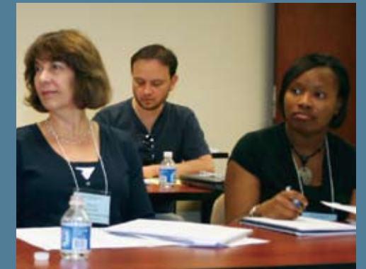
Small, intensive seminars

Office of Admissions & Student Services (919) 966-4260 nursing@unc.edu Fax: (919) 966-3540