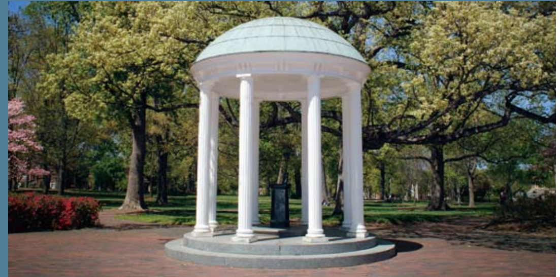
UNC-Chapel Hill Old Well

Predoctoral and Postdoctoral Fellowships