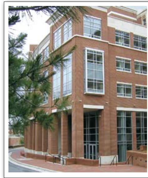
School of Nursing, The University of North Carolina at Chapel Hill

Post-doctoral fellows will receive two years of funding, including an annual stipend, tuition assistance, health insurance, allowance for research related expenses, and one conference trip per year. The stipend